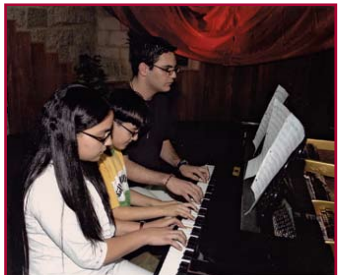
The three siblings seated together at the piano.