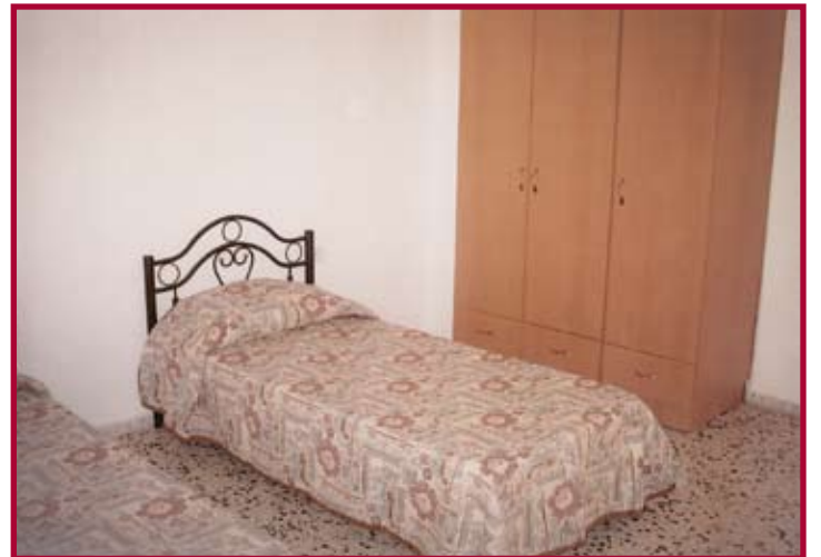
Pictured are various interior features of the Bethlehem Boys Home.