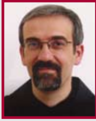
Fr. Pierbattista Pizzabala, OFM

"Therefore, since we have been justified by faith, we have peace with God through our Lord Jesus Christ, through whom we have gained access (by faith) to this grace in which we stand, and we boast in hope of the glory of God. Not only that, but we even boast of our afflictions, knowing affliction produces endurance, and endurance, proven character, and proven character, hope, and hope does not disappoint, because the love of God has been poured out into our hearts through the holy Spirit that has been given to us".