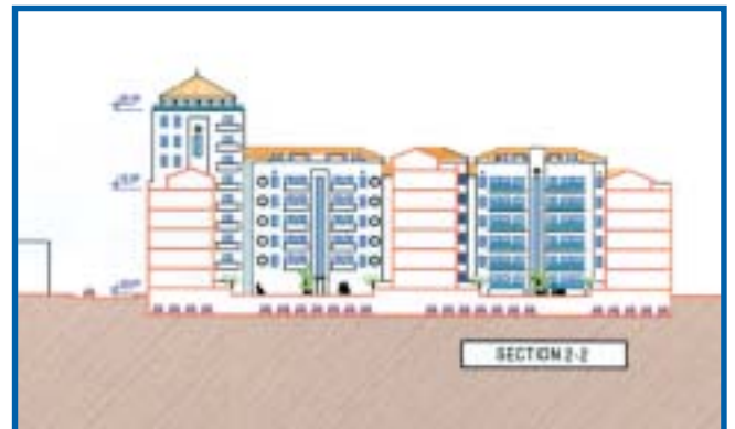
The Jaffa Housing Project, Yeffet Street, Jaffa