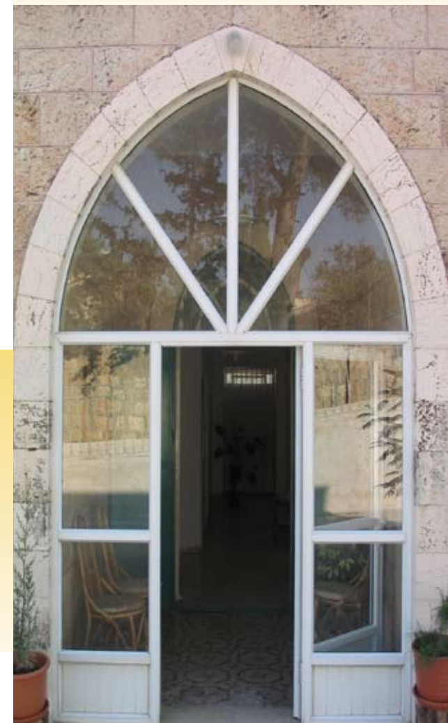
Christian Family Counseling